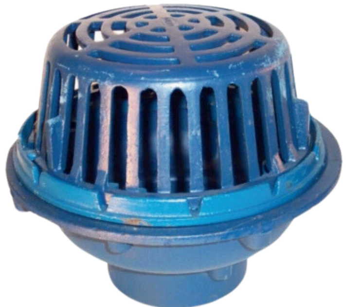
Doom Roof Drain 4"